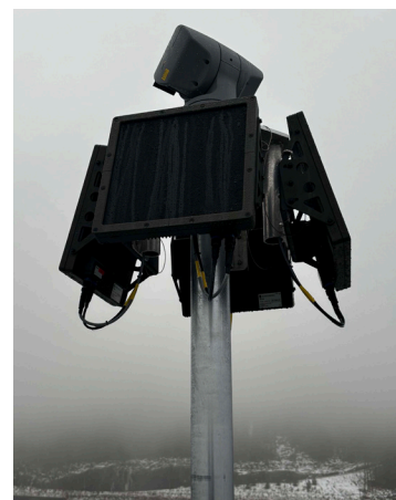
Quad DR 100 with PTZ camera for 360° coverage

Specifications subject to change without any further notice.