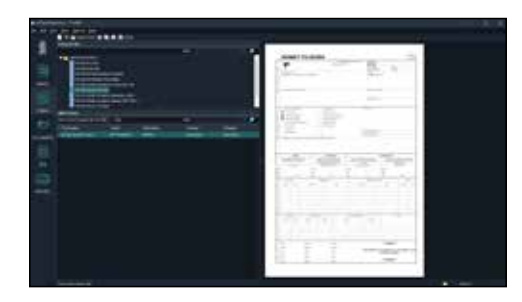
Electronic Forms (dark screen mode)